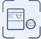
Dual Screen Display