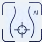
Automatic Bladder Positioning

Leveraging intelligent positioning technology , the M5 offers additional features such as bladder wall thickness measurement & a dual-screen display for optimal positioning of the scanner.