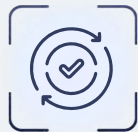
Automatic Patient Type Selection