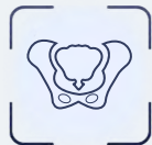
Pubic Bone Interference Indicator