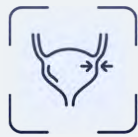
Bladder Wall Thickness Measurement