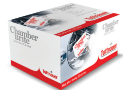
Chamber Brite Autoclave Cleaner