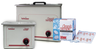
Clean&Simple™ Ultrasonic Cleaners and Tablets

Documents: date, time, temperature, pressure.