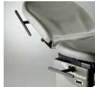
Back/Base Accessory Rails Surgical Size 1 1/8" and Standard Size 1"