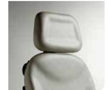
Rectangular Headrest Dimensions: 12" H x 18" W