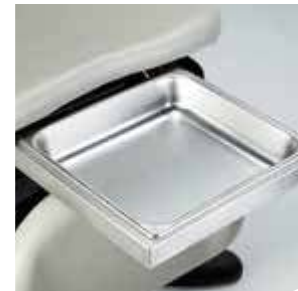
Gynecology Debris Tray Larger Optional Debris Tray 13" W x 12" L x 2 1/2" D