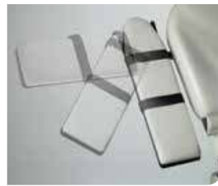
Articulating Armboard Dimensions: 7" W x 24" L