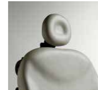
Round-Shaped Headrest Dimensions: 8" H x 9" W