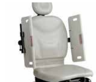
Security Side Panels