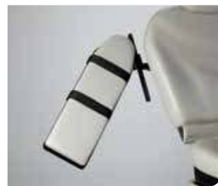
Fixed Armboard Dimensions: 7" W x 24" L