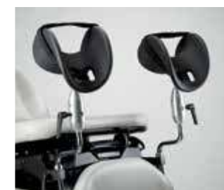
Articulating Knee Crutches