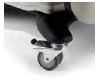
Locking Casters 3 1/2" added height