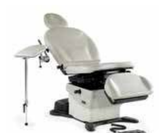
Hand Surgery Armboard Dimensions: 8 1/2" W x 26" L