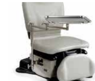
Double Arm Instrument Tray