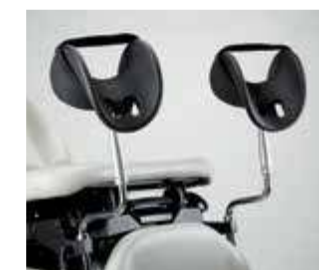
Standard, Non-Articulating Knee Crutches