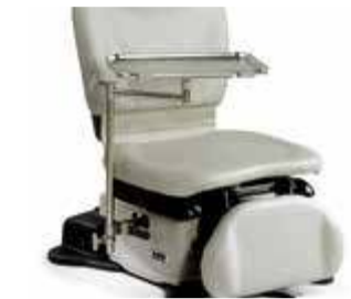
Single Arm Instrument Tray