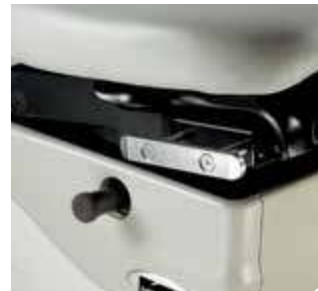
Seat Rails Surgical Size 1 1/8"