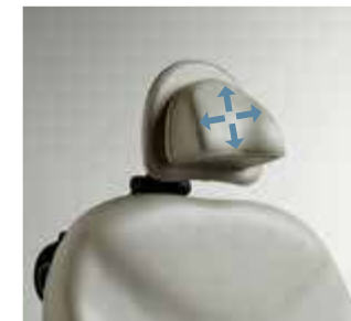
Magnetic Headrest Dimensions: 8" H x 10" W