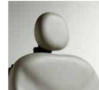
Flat Headrest Dimensions: 8" H x 9" W