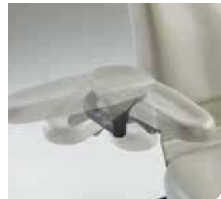
Swivel Chair Arms Available to fit 28" and 32" upholstery widths

Precise positioning and improved comfort means supporting patients where they need it most.