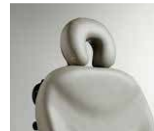
U-Shaped Headrest Dimensions: 8" H x 11" W