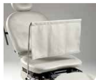
Vision Block Screen